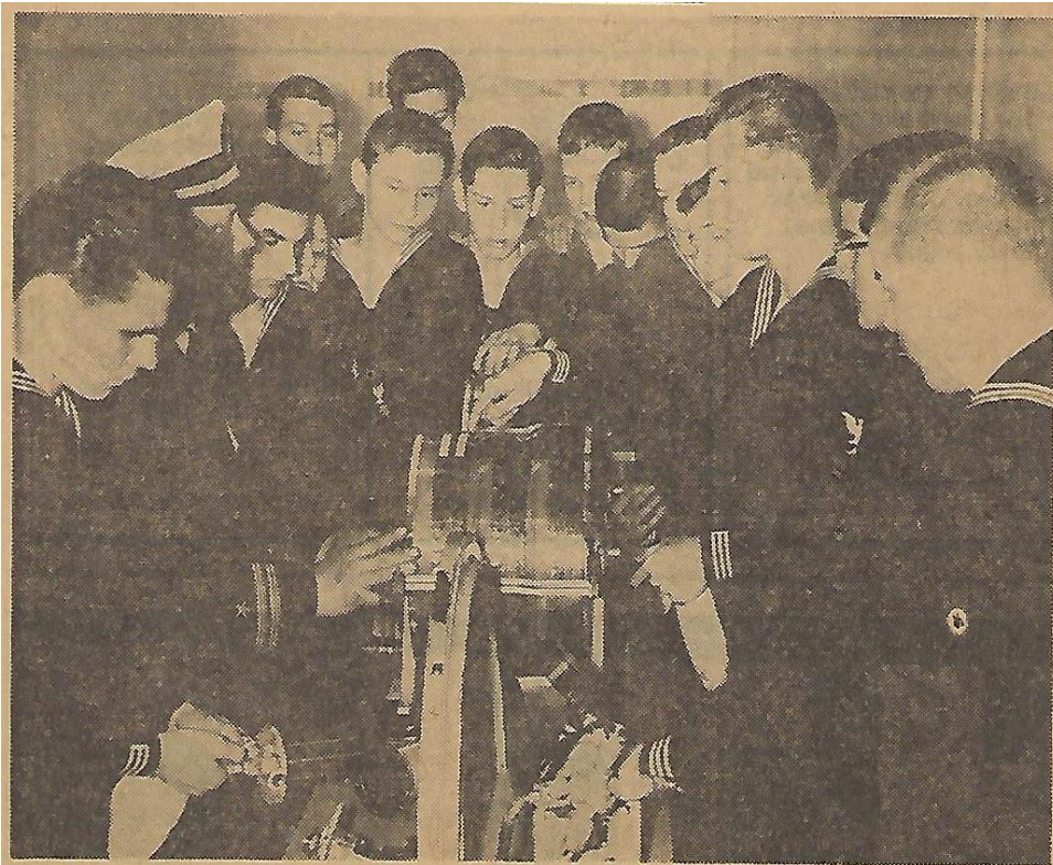
Dad with his Sea Scouts.

apparent, or you don't have the energy to pursue them. He was working with those spirits who had shown an interest in fixing mechanical things while on Earth.