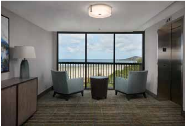
Amazing views of & easy access to the beach