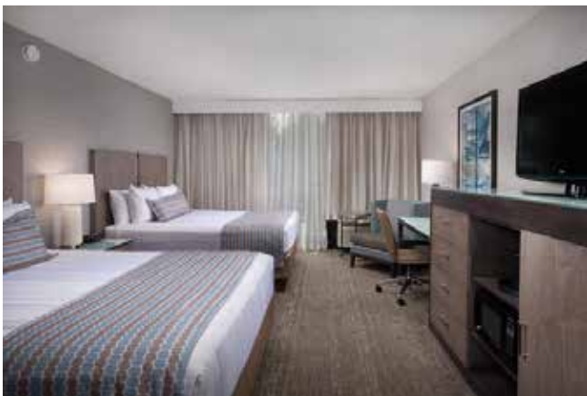
Lovely rooms with either one king-sized bed or two queen-sized beds