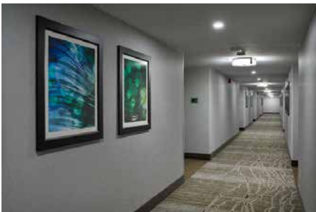
Beautiful & comfortable ambience