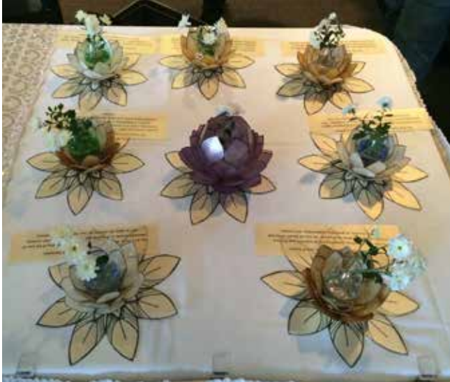
The Universal Laws Altar

Saturday night we had a marvelous dinner at the Crosswinds Restaurant. Yum! Great company and great music by a local guitarist.