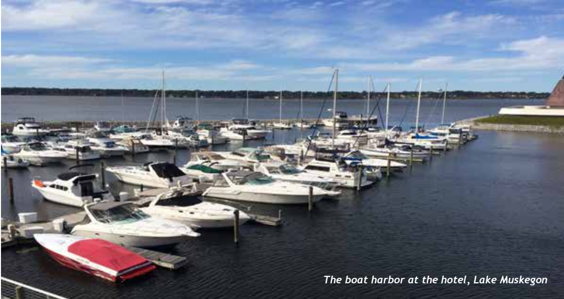
The boat harbor at the hotel, Lake Muskegon

Lake Muskegon (a bay of Lake Michigan) provided a lovely backdrop for The 18th Gathering this year, and our Michigan hosts were more than up to the challenge of making all of us “outsiders” feel very much at home. The hotel/conference center was lovely and the food was great. The presentations were excellent. But, of course, the best part of the weekend was seeing old friends and making new ones.